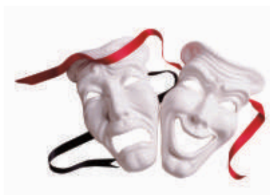
Masks